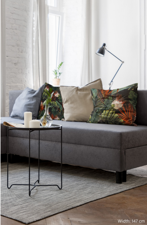
Width: 147 cm

Deco, Cushions, Bed linen, Curtains, Fashion, Table clothes, Accessories, Bags