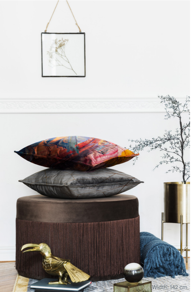
Width: 142 cm