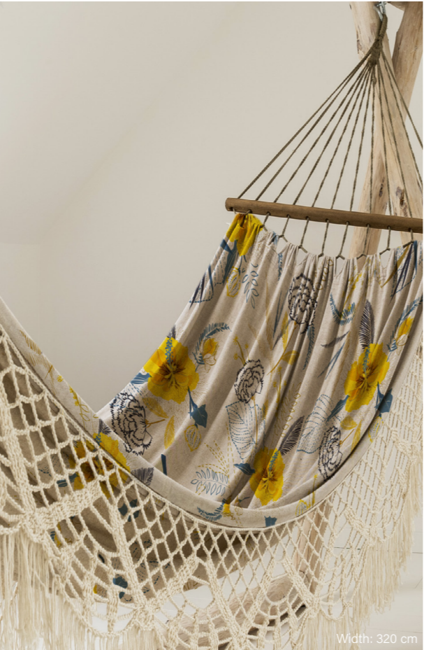
Width: 320 cm

Deck Chair, Hammock, Interior, Curtains, Bean Bags, Stand Construction